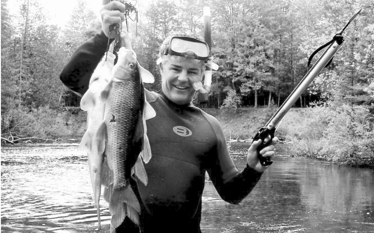
Headed for the smoker. These large redhorse suckers were skewered with a spear gun on the Manistee River. One of them is a free-diving spearfishing world record.

My passion for diving has also evolved into a love of free-dive, spear fishing in Michigan waterways. I ply this unusual activity with either of my two spear guns—a 24-inch JBL mini-carbine and a heftier 45-inch wood JBL 38-Special. The mini-carbine is more easily carried and maneuvered in the water but after having arrows literally bounce off of big carp and suckers I knew it was time to, "break out the big guns" and purchased the 38-Special (new on E-Bay for ~$180-$200). You can shoot only 14 species legally in Michigan. I target those that are good to eat fried, baked, or smoked including whitefish, catfish, burbot, and suckers. I have managed to set two free-dive spear fishing World Records for a 10+ pound channel catfish and 5+ pound northern redhorse