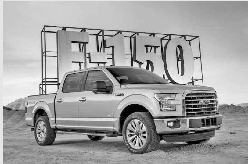
The 2016 Ford F-150 – the toughest, smartest, most capable and safest F-150 ever – is the only large pickup to earn an Insurance Institute for Highway Safety Top Safety Pick for SuperCrew and SuperCab configurations.

A cross-functional group of Ford truck veterans worked thousands of hours to deliver improved durability, capability, fuel economy and