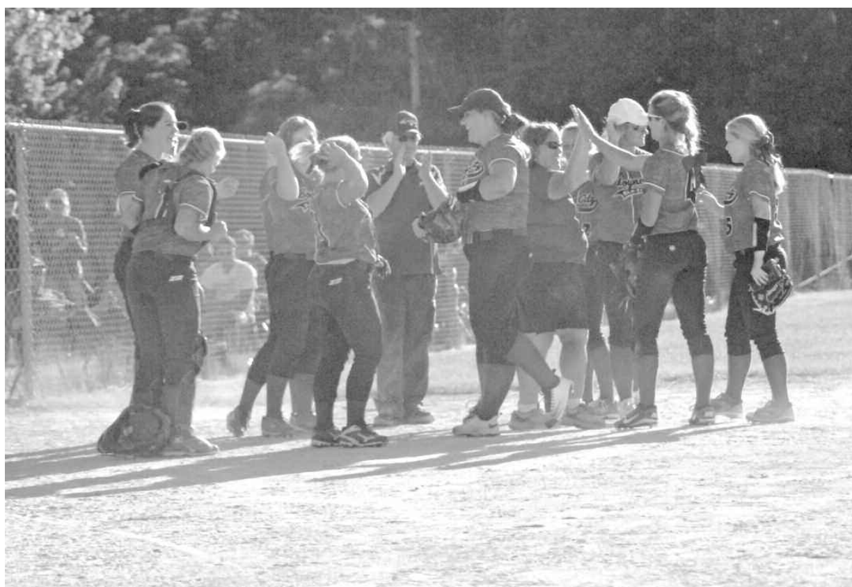
The Boyne City softball team congratulates each other following the final out of district play.